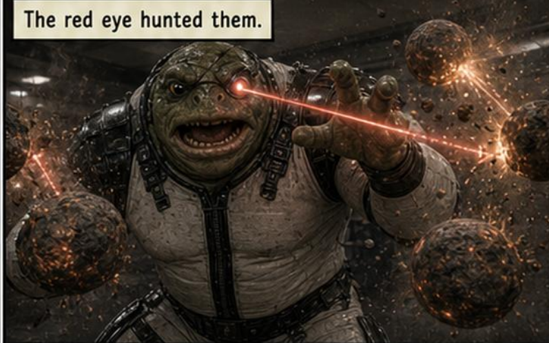
The red eye hunted them.