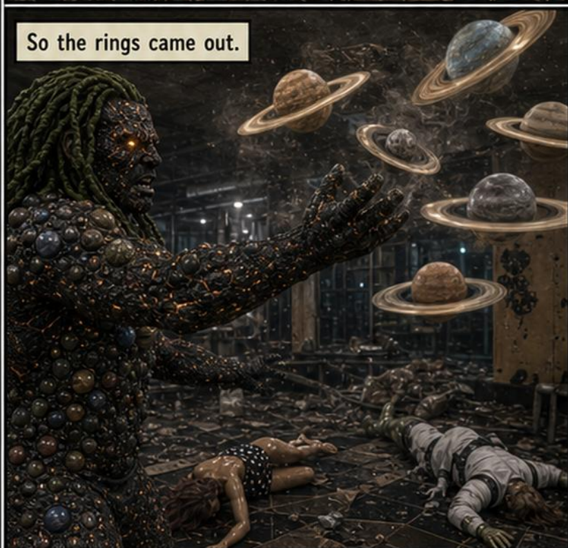
So the rings came out.