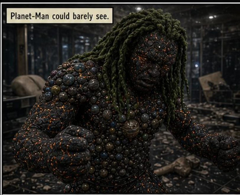
Planet-Man could barely see.