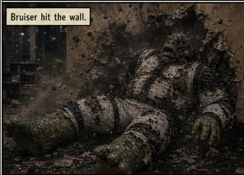
Bruiser hit the wall.