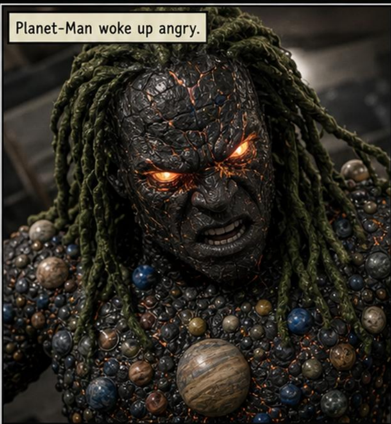
Planet-Man woke up angry.