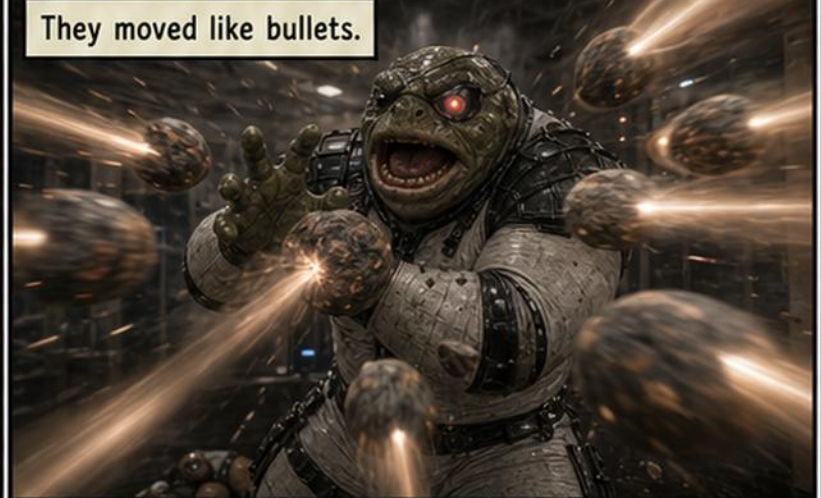
They moved like bullets.