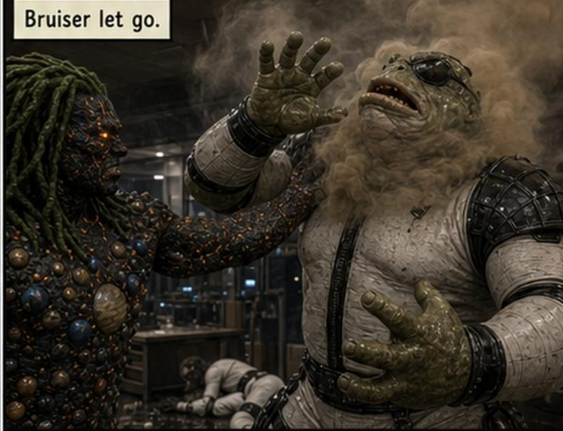
Bruiser let go.