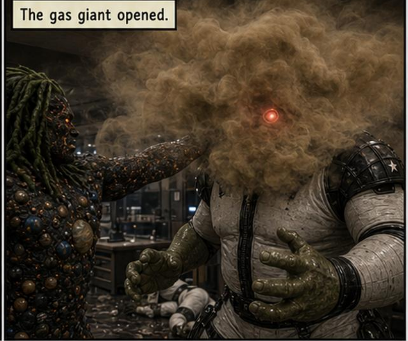
The gas giant opened.