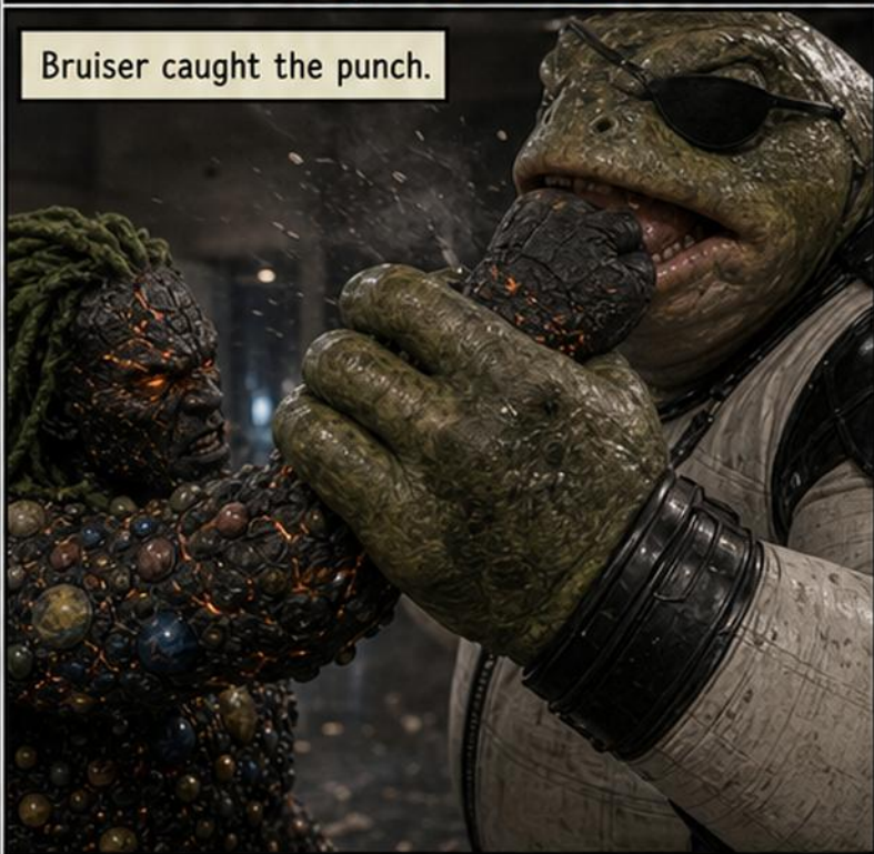
Bruiser caught the punch.