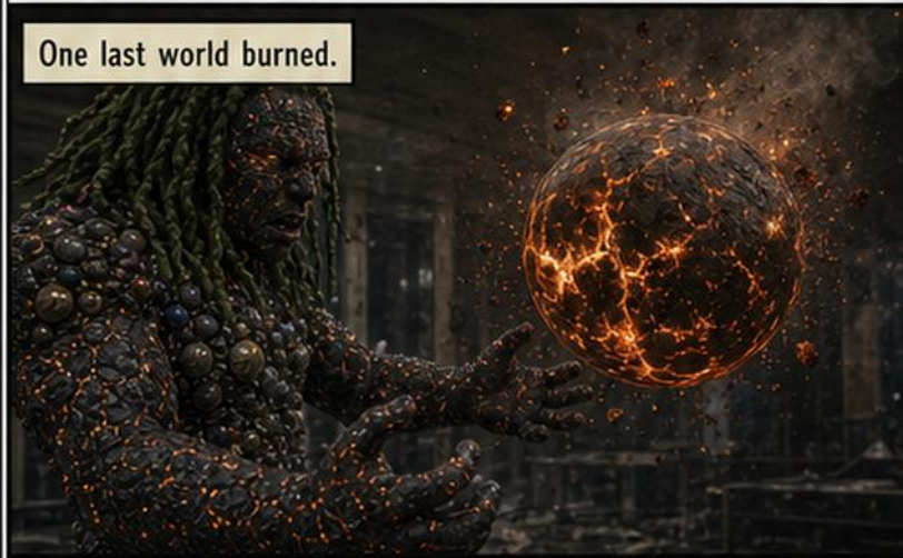
One last world burned.