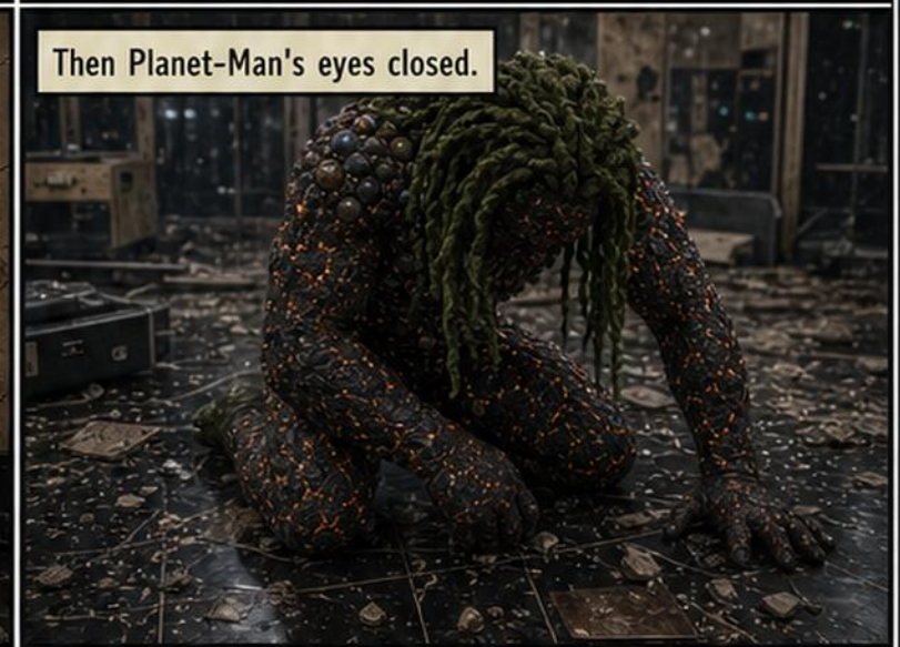
Then Planet-Man's eyes closed.