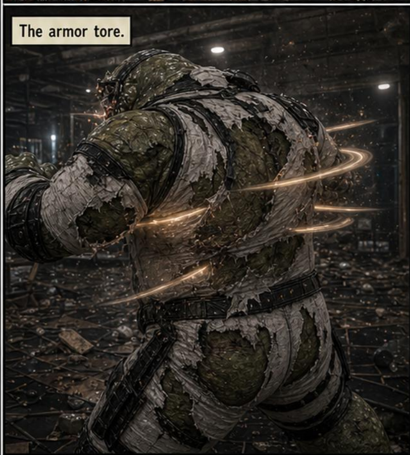
The armor tore.