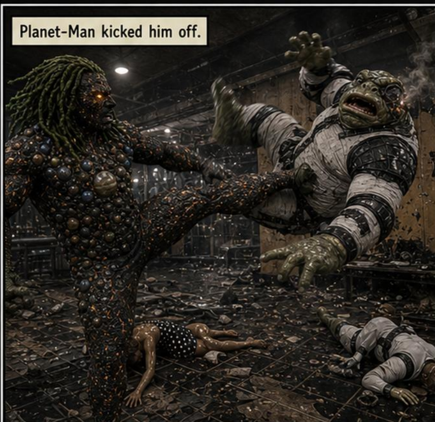
Planet-Man kicked him off.