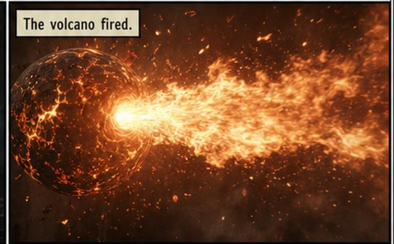
The volcano fired.