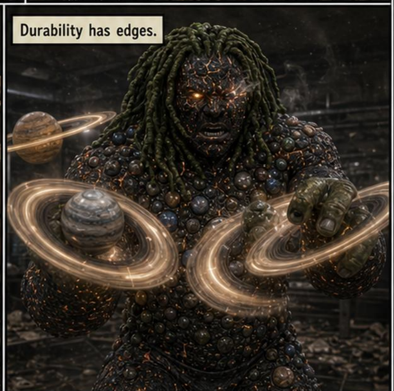
Durability has edges.