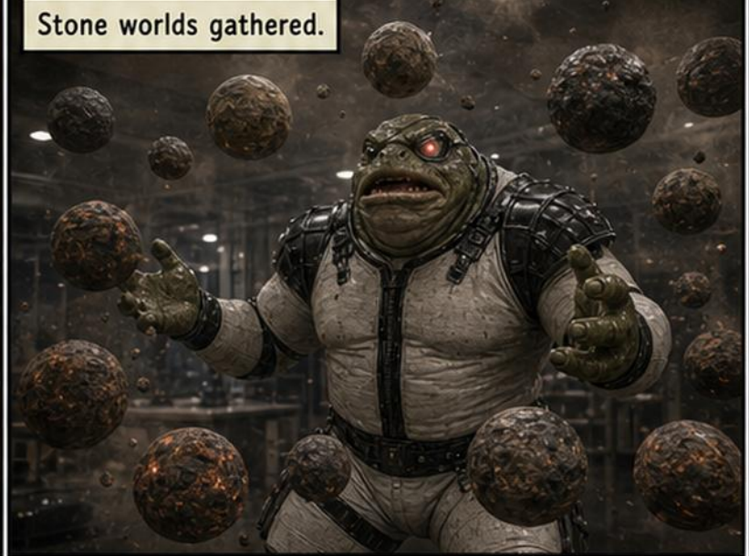
Stone worlds gathered.