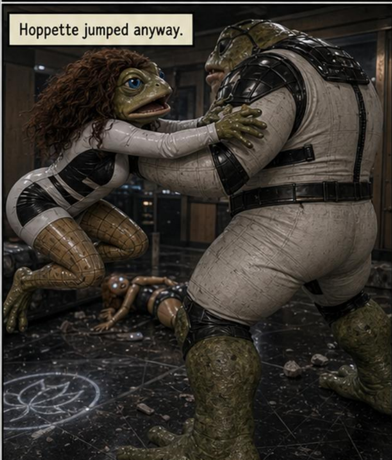
Hoppette jumped anyway.