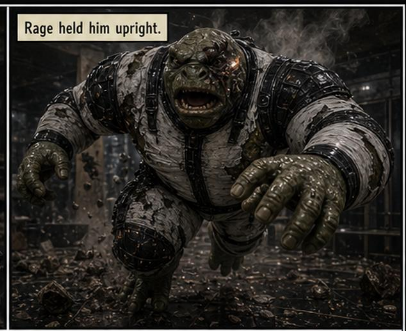
Rage held him upright.