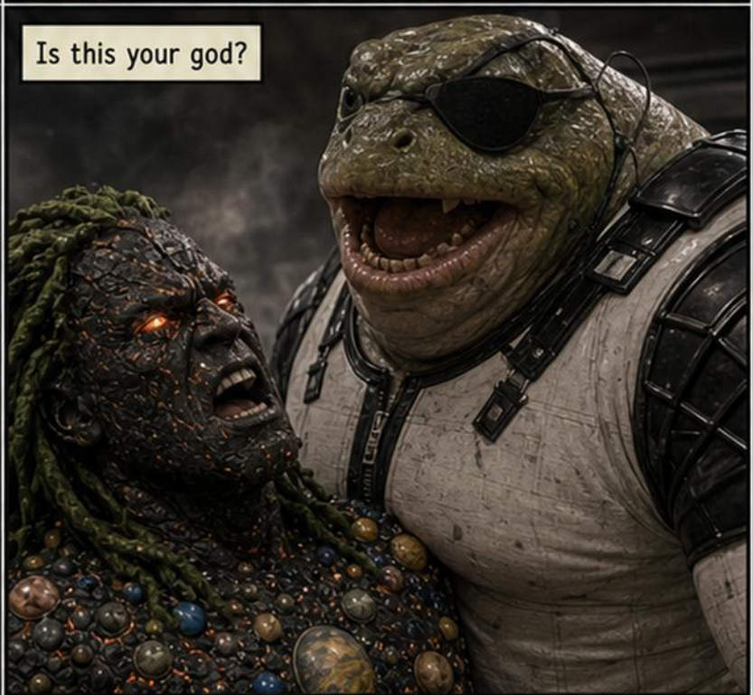
Is this your god?