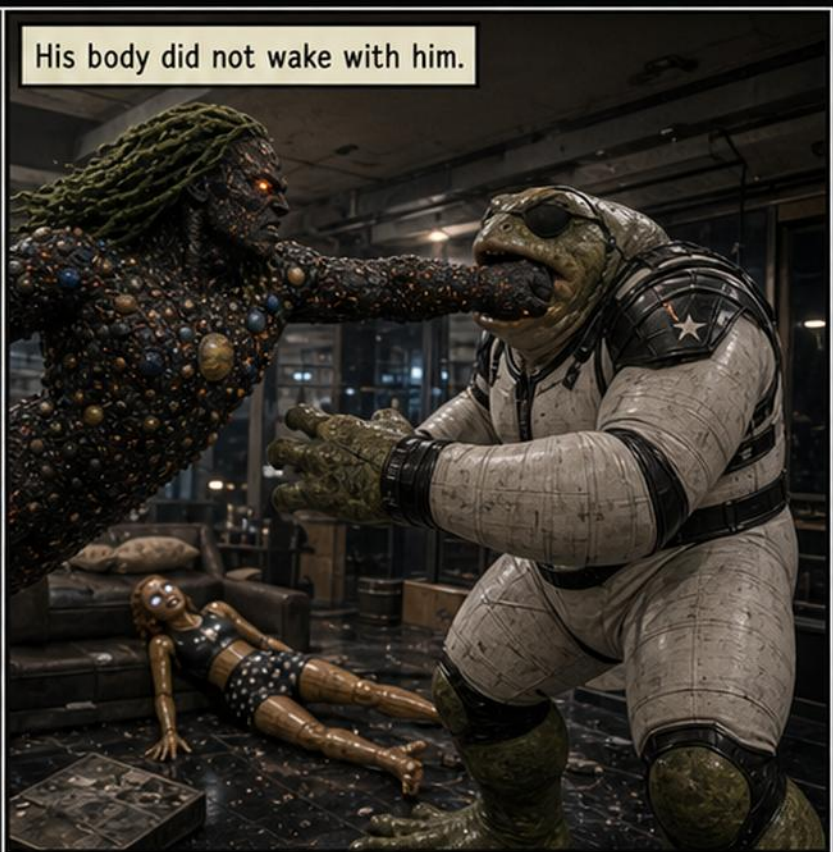
His body did not wake with him.