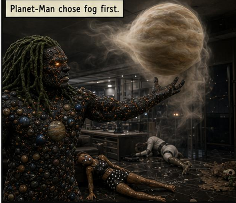
Planet-Man chose fog first.